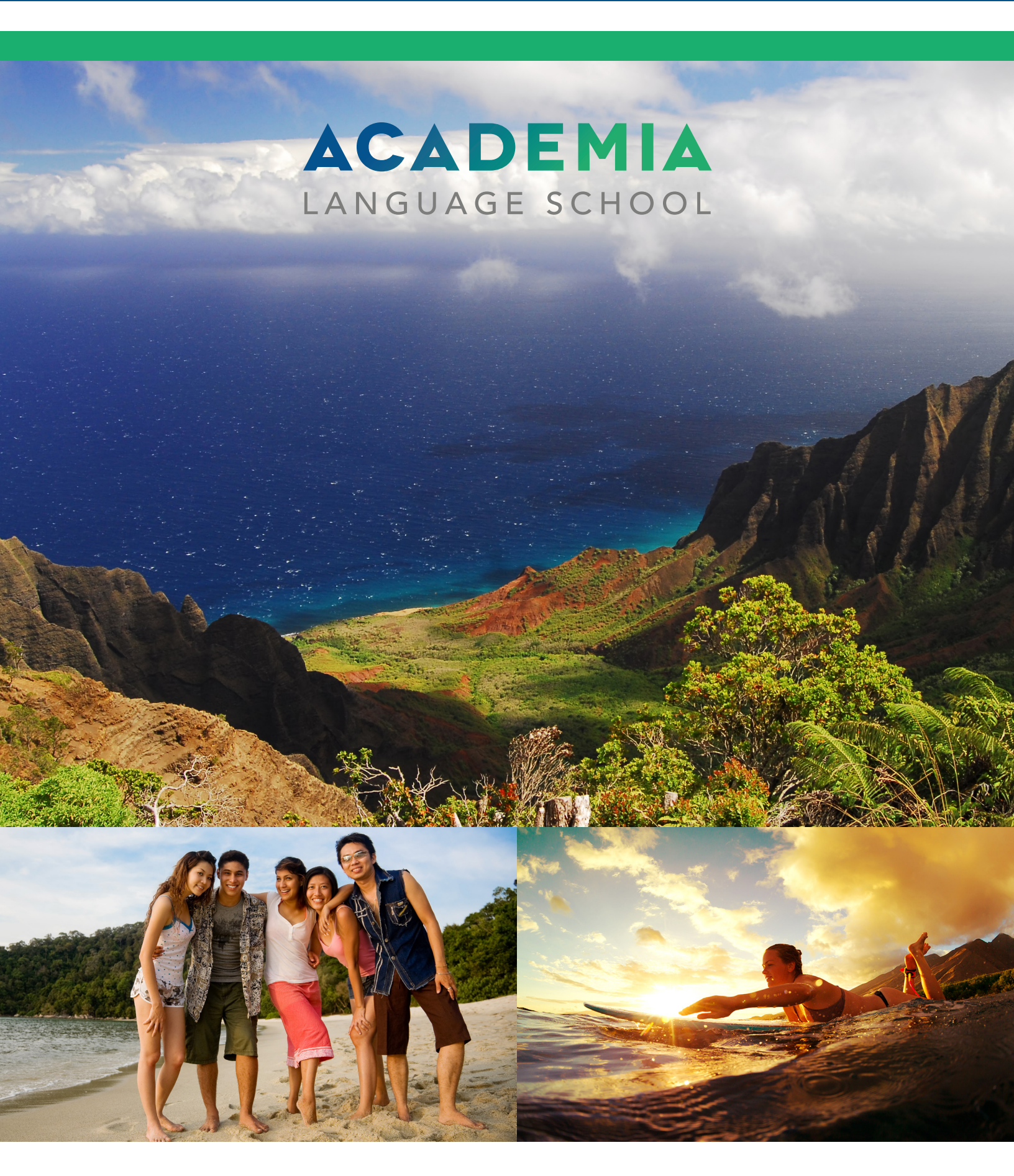
Learn English in Hawaii at Academia Language School!